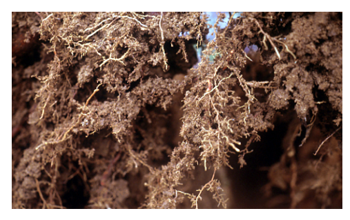
Figure 1: Fine feeder roots growing in well drained soil

Wet soils stay wet for several possible reasons. These include: